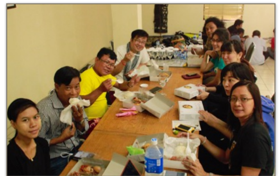
Above: ASEAN's artists collate ideas over lunch after rehearsals.